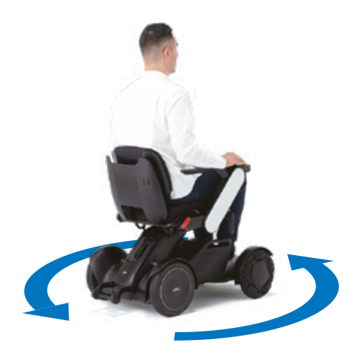
76 cm turning radius The WHILL is easy to manoeuvre and can navigate tight spaces, making it ideal for use in small indoor areas.