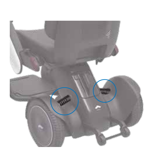
Rear wheel suspension absorbs the impact when driving over bumpy roads or obstacles.