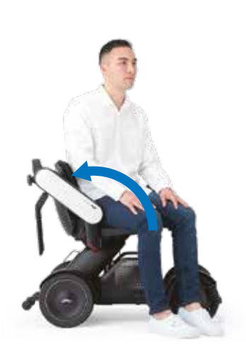
Retractable arm rest Lift up the arm rest to easily sit down in the chair from the side. Stand on the foot rest for added stability.