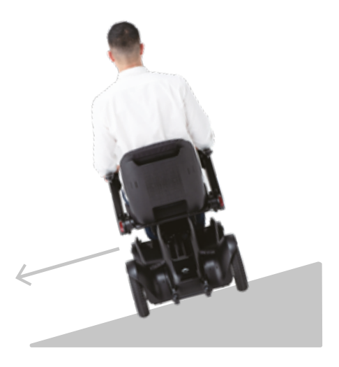
The WHILL Model C2 is designed to prevent drifting. Drive straight on a tilted path.