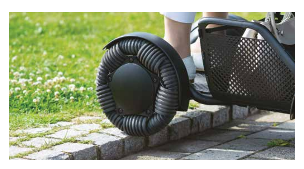
Effortlessly negotiate obstacles up to 5 cm high.

Thanks to its two powerful motors and innovative wheels, the WHILL Model C2 can be used on terrain that a standard wheelchair can't handle. Holes in the road, uneven terrain, grass and gravel will no longer be an issue.