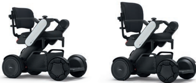
Adjustable tubular back support (Model C2 Back Support Mounting System - see page 19)