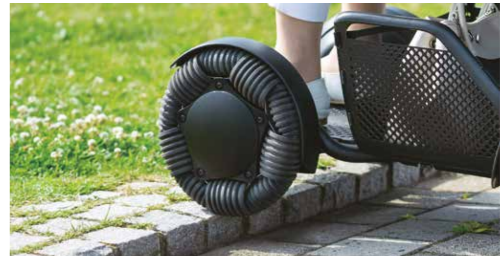
Effortlessly negotiate obstacles up to 5 cm high.

Thanks to its two powerful motors and innovative wheels, the WHILL Model C2 can be used on terrain that a standard wheelchair can't handle. Holes in the road, uneven terrain, grass and gravel will no longer be an issue.