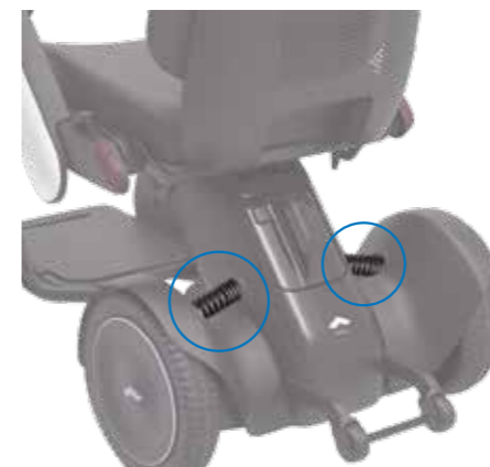
Rear wheel suspension absorbs the impact when driving over bumpy roads or obstacles.