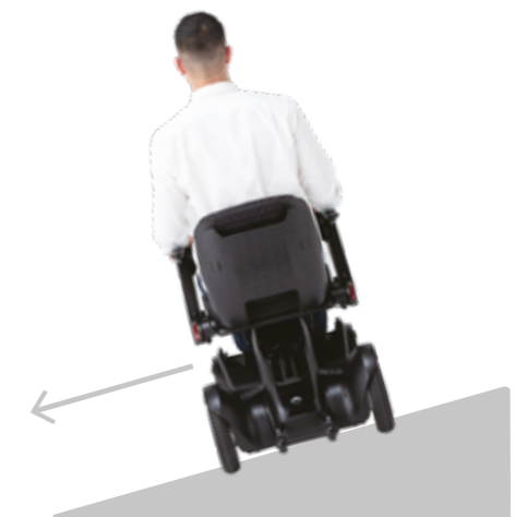
The WHILL Model C2 is designed to prevent drifting. Drive straight on a tilted path.