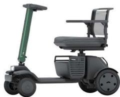
● Racing Green