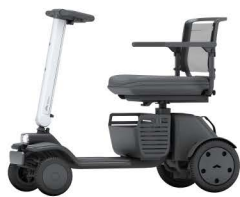
○ Iconic White