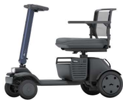
● Lapis Blue