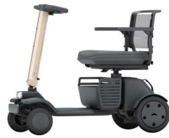
● Silky Bronze