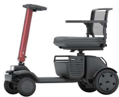
● Garnet Red