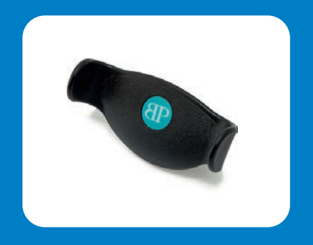
Stick type U-shape type