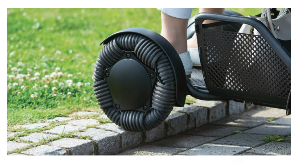
Effortlessly negotiate obstacles up to 5 cm high.

Thanks to its two powerful motors and innovative wheels, the WHILL Model C2 can be used on terrain that a standard wheelchair can't handle. Holes in the road, uneven terrain, grass and gravel will no longer be an issue.