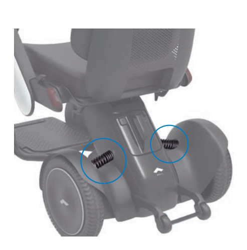
Rear wheel suspension absorbs the impact when driving over bumpy roads or obstacles.