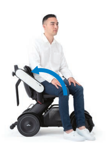
Retractable arm rest Lift up the arm rest to easily sit down in the chair from the side. Stand on the foot rest for added stability.