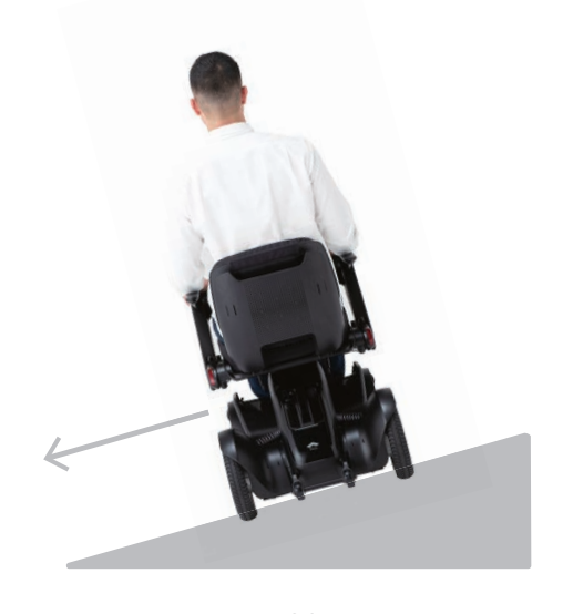
The WHILL Model C2 is designed to prevent drifting. Drive straight on a tilted path.